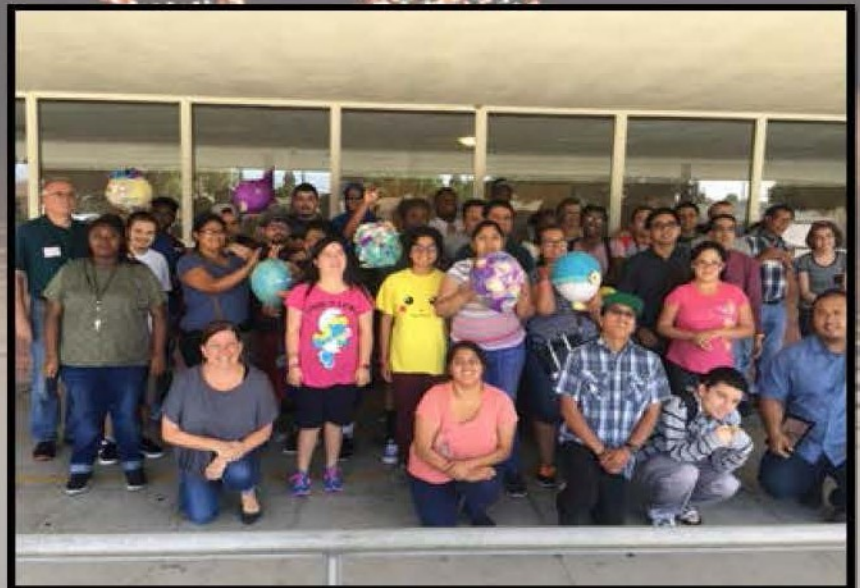
GO-LBC Summer youth development program attendees.

"Know thyself means separating who you are and who you want to be from what the world thinks you are and wants you to be." -Socrates